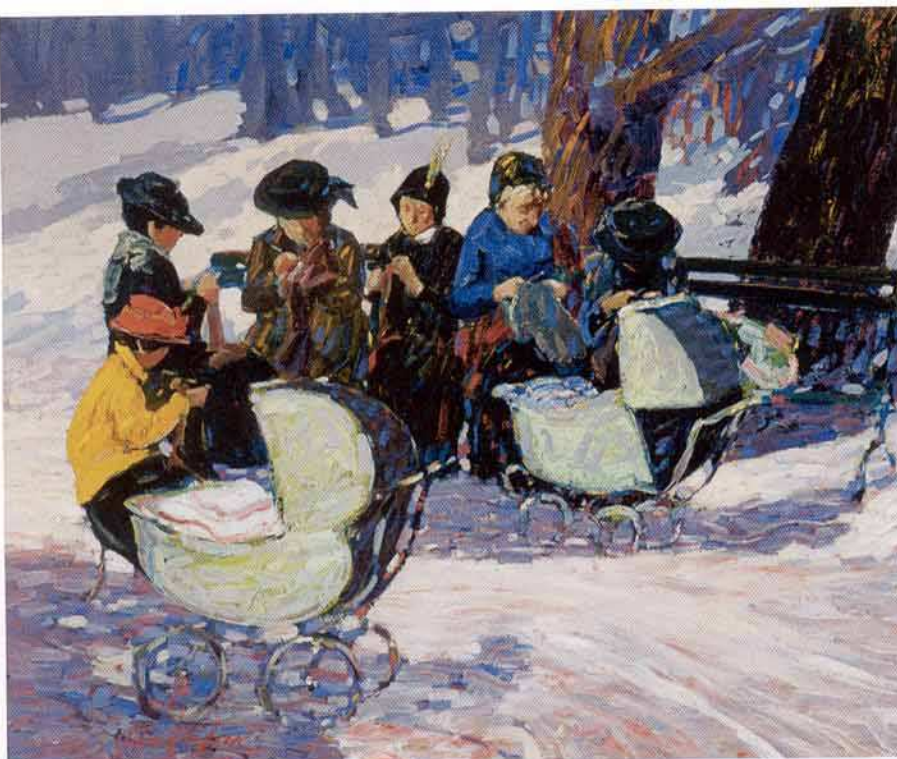
LEFT: George Luks, Knitting for the Soldiers: High Bridge Park , c. 1918, o/c, 30 3/16 x 36 1/8, Terra Foundation for American Art, Daniel J. Terra Collection.

BELOW LEFT: Ernest Lawson, Spring Tapestry , c. 1930, o/c, 40 1/8 x 50, New Britain Museum of American Art, Charles F. Smith Fund.