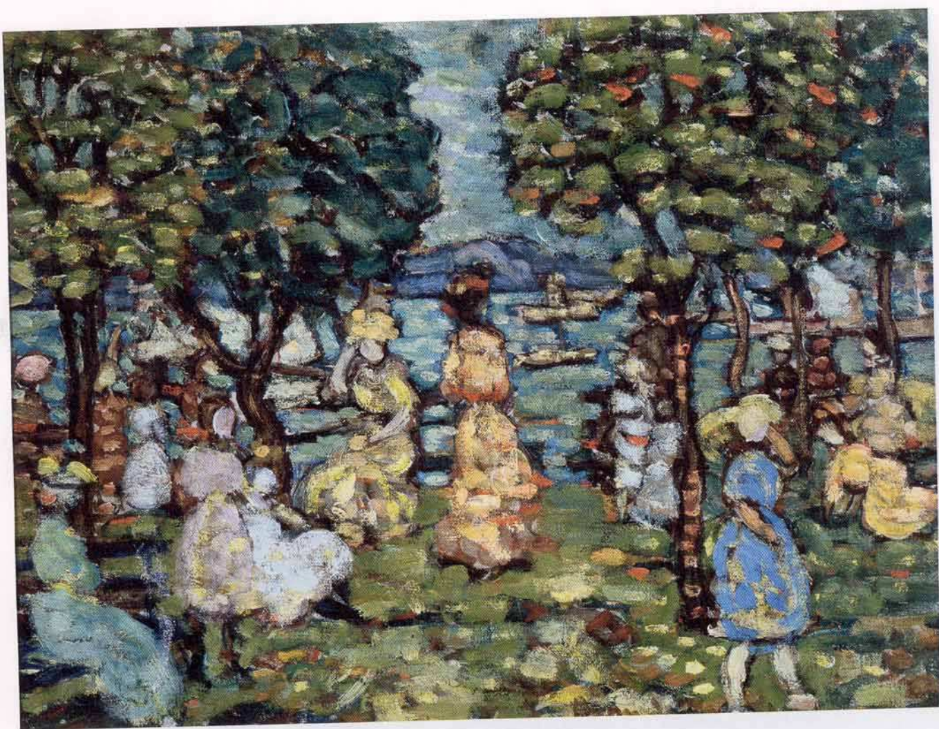
ABOVE: Maurice B. Prendergast, Salem , 1913-15, o/c, 14 1/4 x 18 1/4, New Britain Museum of American Art, Harriet Russell Stanley Fund.