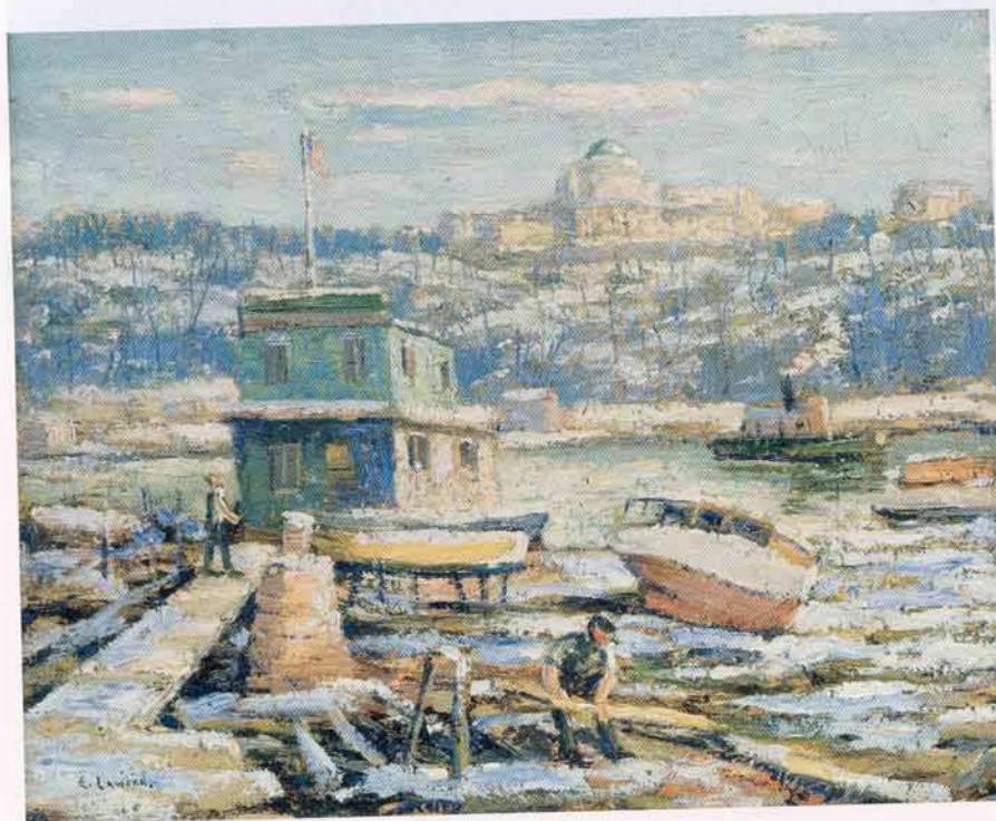
LEFT: Ernest Lawson, Boat Club in Winter , c. 1915, o/c, 16 5/16 x 20 1/4, Milwaukee Art Museum, Samuel O. Buckner Collection.