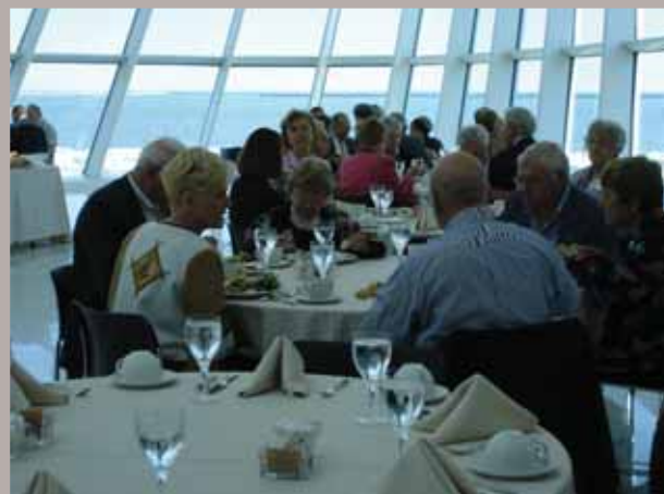
Fine Arts Society Members enjoy lunch in Windhover Hall before a lecture.