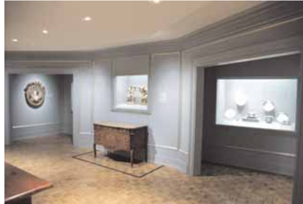
The Fine Arts Society provided funds in 2000 to help with the installation of the French Period room.