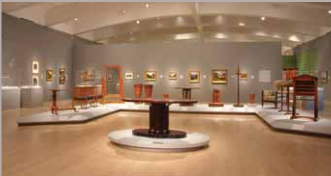
The Fine Arts Society sponsored a number of events for the exhibition Biedermeier: The Invention of Simplicity . The Society also raised funds to purchase the magnificent Biedermeier table, shown in the center of the lower photo, for the Milwaukee Art Museum's Collection.