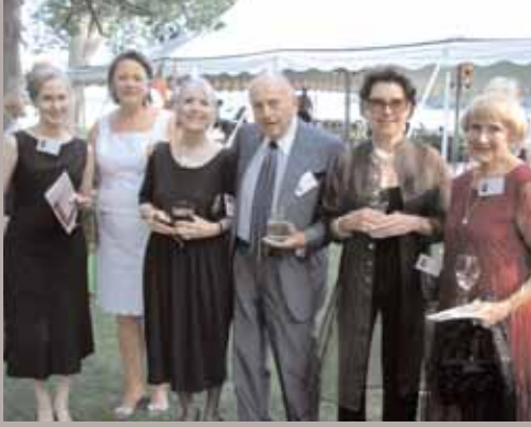
Fine Arts Society Members organized An Evening in Biedermeier Vienna , an event that raised funds for acquisitions of Biedermeier art.