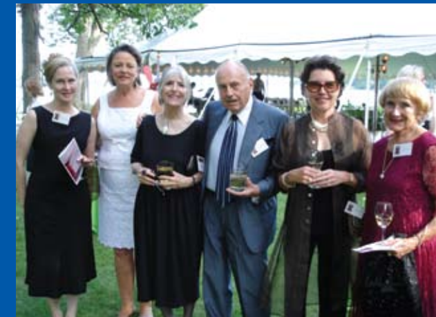
FAS-organized event to raise funds for acquisitions of Biedermeier art.