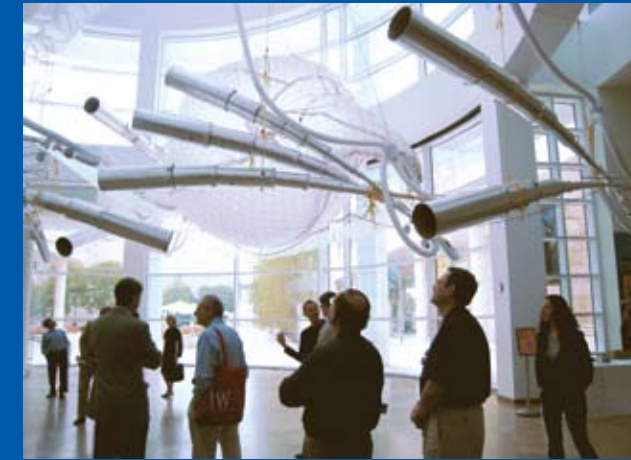
CAS trip to the Getty in Los Angeles, CA.

There is room for every interest and level of experience—from the novice to a veteran in the art world—so read on to find the group(s) that best matches your personal interests and join today!