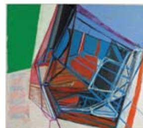
Amy Sillman, P&H , 2007. Oil on canvas. Purchase, with funds from Contemporary Art Society.

CAS provides a forum for those interested in increasing and sharing their knowledge of and appreciation for contemporary art. Members have opportunities to meet influential artists and experts such as Dennis Oppenheim, Fred Tomaselli, Robert Storr, and Gilbert & George, and to travel to other museums, international art fairs, and world-class private collections. CAS hosts a biennial art auction to raise money for the acquisition of contemporary works for the Museum's Collection.